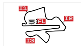
Petronas Sepang International 5543 m. Circuit