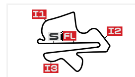
Petronas Sepang International 5543 m. Circuit