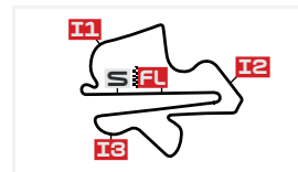
Petronas Sepang International 4,423 m. Circuit