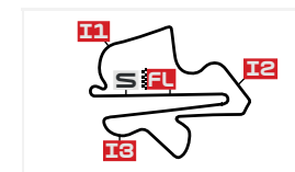
Petronas Sepang International 5543 m. Circuit