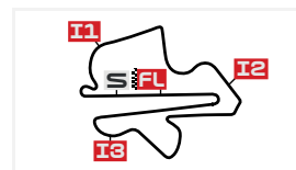
Petronas Sepang International 4.23 m. Circuit