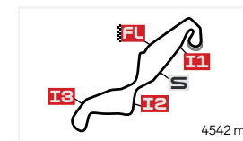
TT Circuit Assen